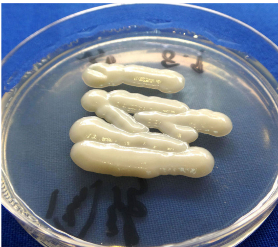
Figure 3 The cultured microorganism. Shiny, light-yellow mucoid colonies on Sabouraud's dextrose agar.