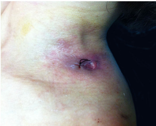
Figure 1 Ulcer on the left shoulder. The cutaneous ulcer on her left shoulder, after a skin biopsy.