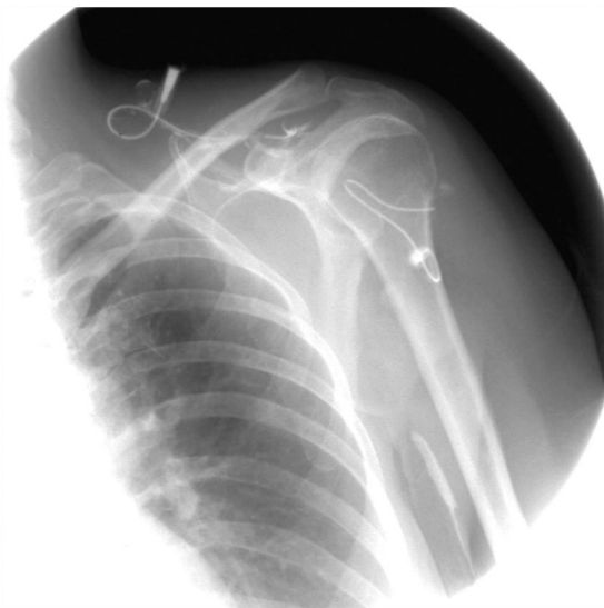
Figure 2 Irregular subcutaneous sinus tracts. A sinogram illustrating irregular sinus tracts extending from the cutaneous ulcers.