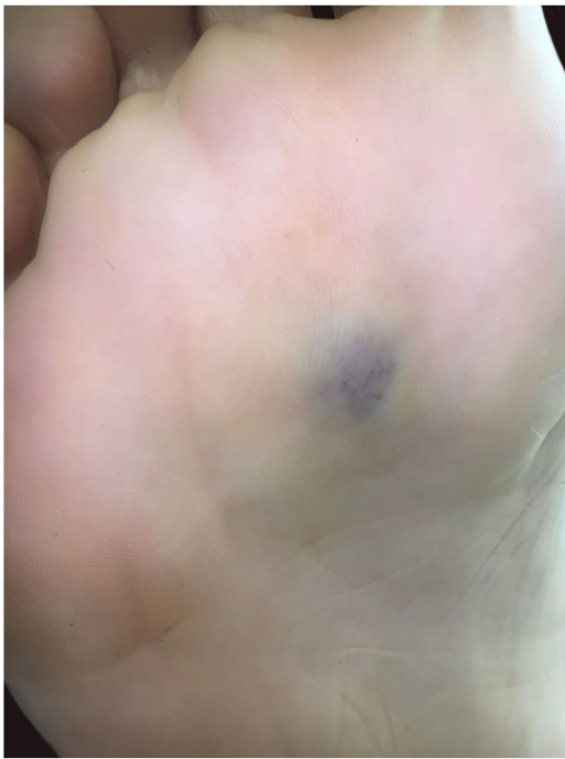
Figure 1 Violaceous lesion, with poorly defined limits, on the sole of the right foot.