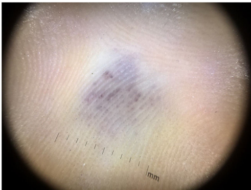
Figure 2 Dermoscopy showed homogeneous global pattern of violaceous staining with blackened red dots, distributed inside the lesion.