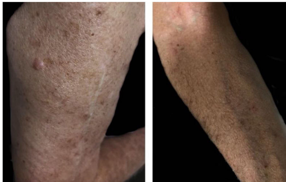
Figure 2 Remission of lesions in right arm (A) and forearm (B).