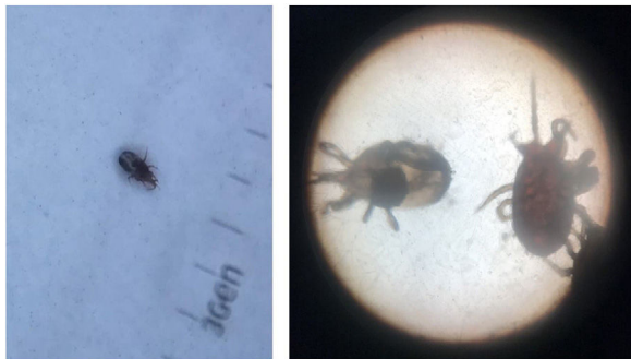
Figure 3 (A) Dermoscopy of the mite. (B) Identification of mites of the species Dermanyssus gallinae by optical microscopy.

and air-conditioning boxes. There are also nosocomial cases. 1,2