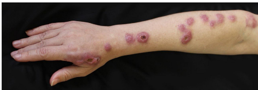
Figure 1 Clinical picture prior to treatment with terbinafine. Nodules approximately 2 cm in diameter, discretely erythematous that followed the lymphatic drainage pathway of the right upper limb. In some lesions there was formation of central ulcers.