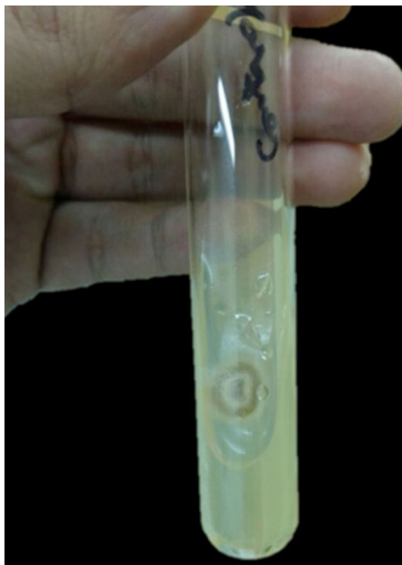
Figure 2 Culture in Sabouraud agar medium.

patient reported that she had undergone RYGB surgery two years before justified by obesity.