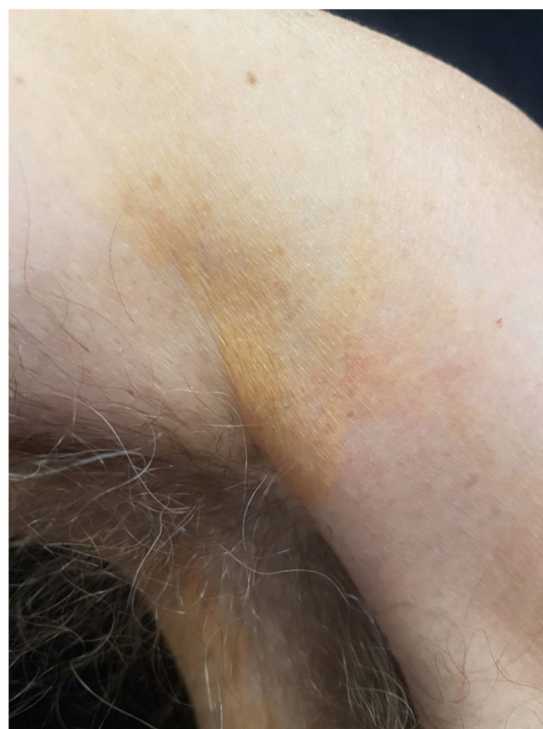
Figure 2 Orange yellow plaque in axillary region.