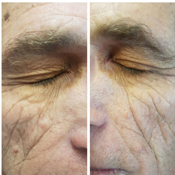
Figure 1 Yellowish, well delimited plaques in the region of eyelids bilaterally.

A 61 year-old man with a history of onset of asymptomatic yellowish spots, 2 years ago, initially on the eyelids. In one year, the lesions also appeared in the armpits, in the inguinal, genital and gluteal regions. He had a recent diagnosis of Hepatitis C (HCV), without treatment. He denied other comorbidities and use of medications. On examination he had yellowish plaques with a symmetrical distribution in the periorbital region bilaterally (Fig. 1), and plaques with regular, well-delimited borders, yellow-orange in the