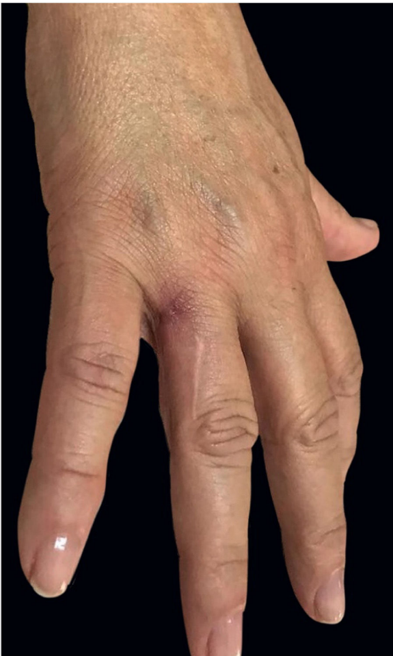
Figure 3 Regression of inflammation after antibiotic treatment.