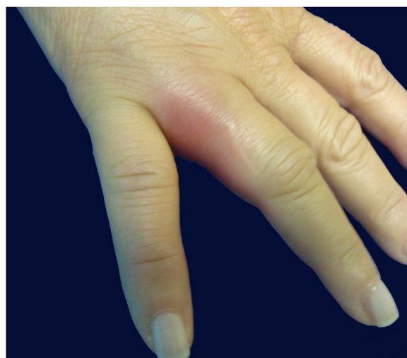
Figure 1 Right hand: edema and erythema on the fourth finger.

species are: M. fortuitum , M. chelonae , and M. abscessus . M. fortuitum is related with hospital infections in immunocompromised patients, leading to pulmonary, soft tissue and bone infections. Cutaneous involvement is more related to postoperative situations and invasive cosmetic procedures. 2 The present case corresponds to cutaneous infection by M. fortuitum in an immunocompetent patient, acquired at home, probably by a trauma in an humid area. Differential diagnosis is made with swimming-pool granuloma, caused by M. marinum , due to the circumstances in which the infection was acquired, but culture allowed to the definitive etiology. The diagnosis of atypical mycobacterioses is made through the isolation of the agent in culture, since radiological, histopathological and clinical examinations are often inconclusive. The history of long-standing infection, without improvement after different treatments, can lead to clinical suspicion. The follow-up includes long-term broad-spectrum antibiotic treatment. The macrolide group in combination with quinolones is one of the most recommended regimens, sometimes requiring surgical intervention. 3,4 The present report reinforces the importance in considering atypical mycobacterioses among the differential diagnoses of traumatic cutaneous lesions, especially when they tend to chronicity.