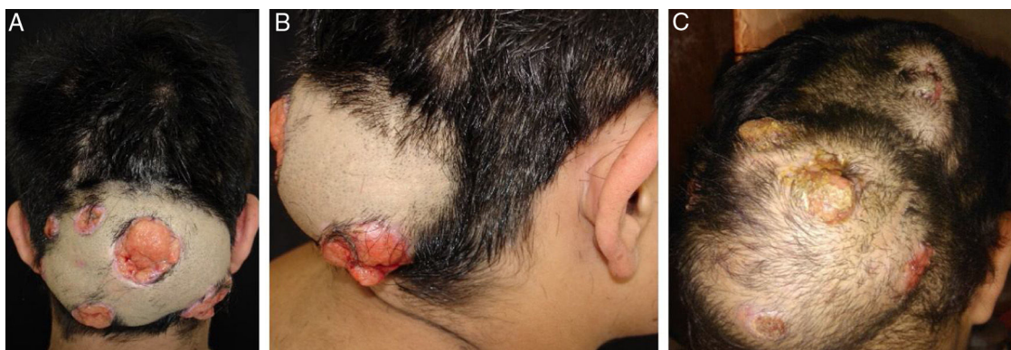
Figure 1 Clinical aspect of pseudomycetoma at occipital lesion. A and B, patient with 14-years-old. C, patient with 24-years-old.