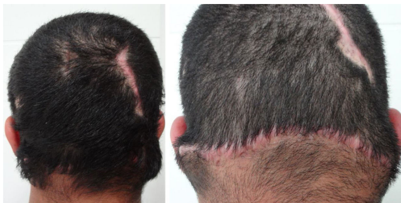
Figure 4 Patient with clinical aspect after treatment.

in the sample (Fig. 3). He denied use of any immunosuppressive medication, presented non-reactive serology for HIV, and had no other comorbidities. Associating the clinical aspect with the complementary tests, the diagnosis of pseudomycetoma by Microsporium canis was confirmed. The patient was submitted to surgical excision of the tumor and associated oral griseofulvin, one gram per day for two years. In a one year follow-up after the end of griseofulvin, the patient showed no signs of relapse (Fig. 4).