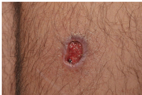
Figure 1 Well-delimited ulcer with clean floor on the leg.