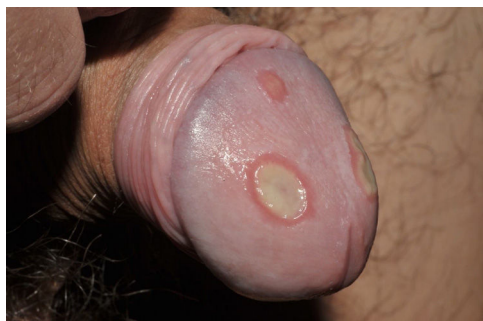
Figure 2 Shallow ulcers on the penis, with fibrin-containing floor.

Tuberculosis is considered multifocal when there is involvement of at least two extrapulmonary sites, with or without pulmonary involvement. It accounts for one-third of the mortality among patients infected with the human immunodeficiency virus (HIV), but it can also affect immunocompetent patients. 4