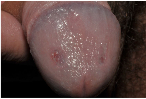
Figure 6 Complete healing of penile lesions after two months with RIPE treatment.