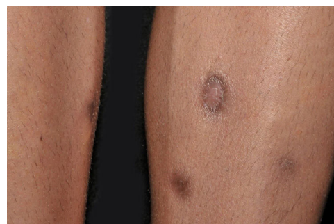
Figure 5 Complete healing of leg lesions after two months with RIPE treatment.

of any kind of immunosuppression. At colonoscopy, multiple shallow ulcers covered by thick fibrin associated with enanthem, mainly in the sigmoid, and aftoid ulcers in the proximal rectum were evidenced. The tuberculin sensitivity test (PPD) was negative and the chest X-ray had no alterations. Anatomopathological examination of one of the ulcers was performed on the lower limb, which revealed an epithelioid granulomatous process with palisade granulomas and central caseous necrosis. The study of acid-fast bacilli (AFB) by Ziehl-Neelsen staining showed intact bacilli (Figs. 3 and 4), and culture was positive for M. tuberculosis , confirming the diagnostic hypothesis of cutaneous TB. The histopathological analysis of the intestinal biopsy revealed a mild inflammatory infiltrate without the presence of bacilli. After the beginning of the RIPE treatment regimen, the patient evolved with complete healing of the ulcers (Figs. 5 and 6) and gradual resolution of the diarrhea and oligoarthritis.