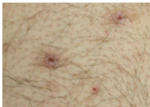
Figure 2 Umbilicated papules with central hemorrhagic crust.

Laboratory results of complete hemogram, blood sugar, liver, and kidney function tests were found to be within normal limits. Histopathological evaluation of a representative skin lesion taken from the left leg showed acanthosis, basket weave orthokeratosis, increased number of vessels in the superficial dermis, and perivascular and interstitial inflammatory infiltrate with erythrocyte extravasation. Punched-out ulceration with cellular debris was observed