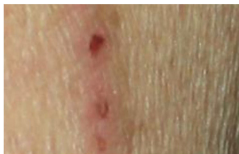
Figure 3 Linear distribution of some papules.