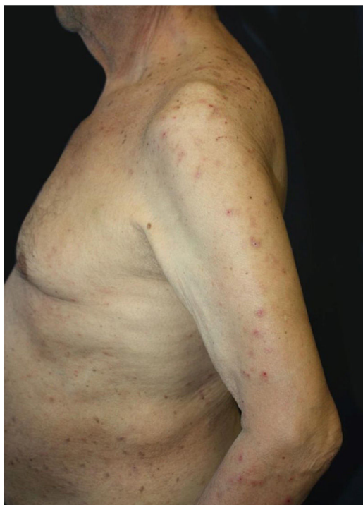
Figure 1 Widespread excoriations and dome-shaped papules with central crusts on the trunk and upper extremity.

collagen from the epidermis. 1 Although the etiology and pathogenesis of ARPC are not fully understood, the disease is commonly associated with systemic diseases such as diabetes mellitus (DM), chronic renal insufficiency, dermatomyositis, hyperuricemia, and malignancies.