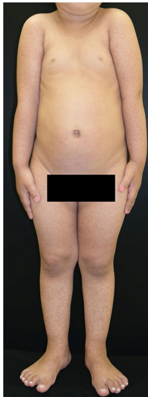
Figure 1 Disseminated hyper- and hypochromic macules scattered over the tegument with mottled appearance.

First described in 1979 by Fischer and Gedde-Dahl, EBS-MP begins in childhood and has a genetic origin. It is a basal