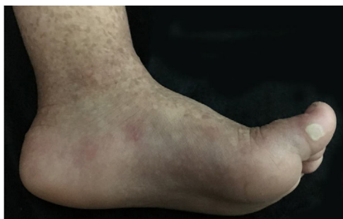
Figure 2 Close-up. Desiccated blisters and vesicles on the left foot.