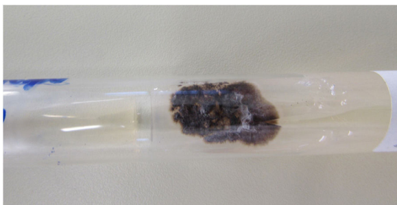
Figure 3 Fungal culture at 25 °C showing a blackish filamentous colony with whitish areas. Colony growth after seven days.

In Brazil, sporotrichosis has been an emerging zoonosis for the last 20 years. With the advent of molecular biology techniques, it has been shown that the classic agent Sporothrix spp. consists of a group of species among which S. brasiliensis , S. schenckii , S. globosa , and S. luriei stand out as human pathogens. 3 With the epidemic of zoonotic sporotrichosis, clinical forms hitherto uncommon are being described, such as hypersensitivity reactions, 4-6 which can present as erythema multiforme, Sweet's syndrome, or ery-