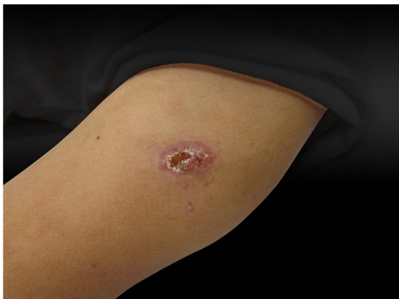
Figure 1 Dermatitis located in the upper portion of the left arm, characterized by an erythematous ulcer with well-defined edges and a granular bottom measuring approximately 1.5 cm in diameter.