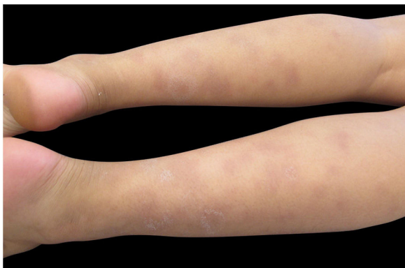
Figure 2 Dermatitis located on the lower limbs, characterized by erythematous and violet nodules of different sizes, more palpable than visible.