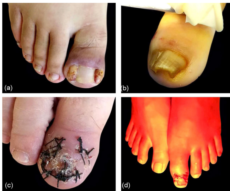
Figure 4 Key points. (A), Large masses in triangular regions. (B), Thick nail plate. (C), Remove the entire nail plate before the operation. (D), Management with water-filtered infrared-A (wIRA).

the present technique was used to treat 67 patients, and had no recurrence observed after six months to one year of follow-up.