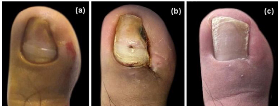
Figure 3 Cosmetic result. (A), Preoperative image. (B), After stitch removal on the 14 th day. (C), Follow-up after one year.