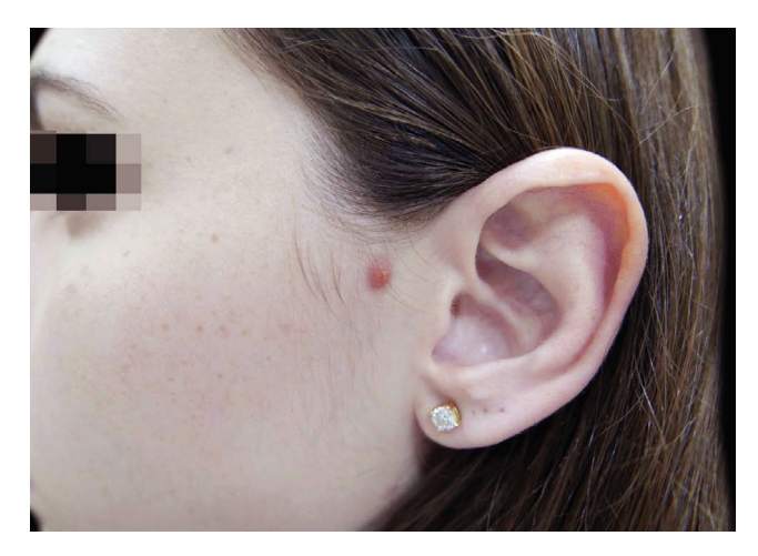
FIGURE 1: Erythematous papule, 7mm in diameter, in the left preauricular region

Histopathological examination revealed localized dermal proliferation of xanthomatous macrophages, sometimes multinucleated, interspersed with mixed inflammatory infiltrate and fibroblasts (Figures 4 and 5). These findings, in correlation with clinical examination and dermoscopy, supported the diagnosis of JXG.