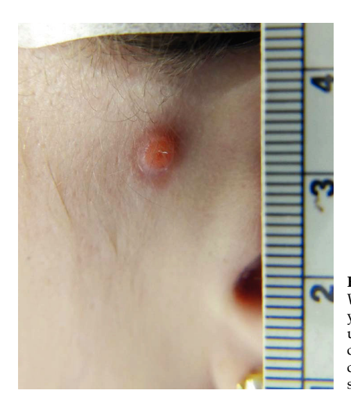
FIGURE 2: Well-defined erythematous papule, with a discrete yellowish center and thin scaly halo