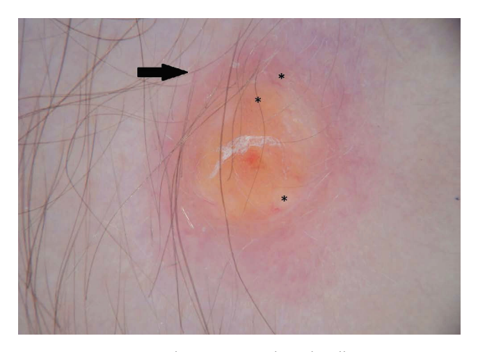
FIGURE 3: Dermoscopy showing a papule with yellow-orange center and an erythematous halo (arrow), characterizing the "setting sun" pattern, with presence of arboriform telangiectasias (asterisk)