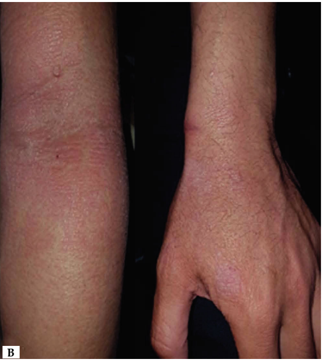
FIGURE 1: A. Erythroderma with facial infiltration. B. Detail of infiltrated plaques on limbs and antecubital region