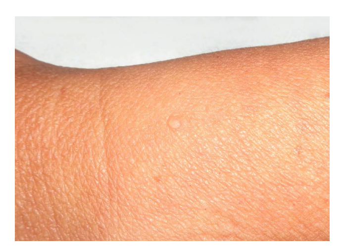
FIGURE 2: A small, 6 mm-diameter skin-colored asymptomatic nodule on the left forearm (patient #2)