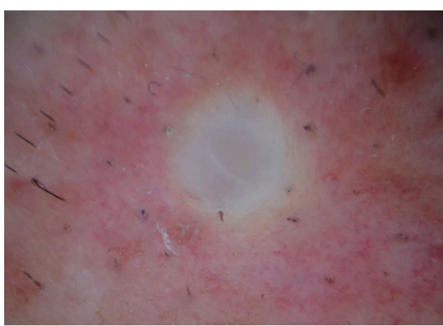
FIGURE 3: Nonspecific homogenous whitish pattern and a sharply demarcated yellow border on dermoscopy (patient #1)