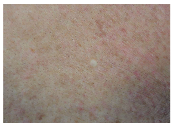
FIGURE 1: Long-standing skin-colored 8mm-diameter asymptomatic nodule on the back (patient #1)