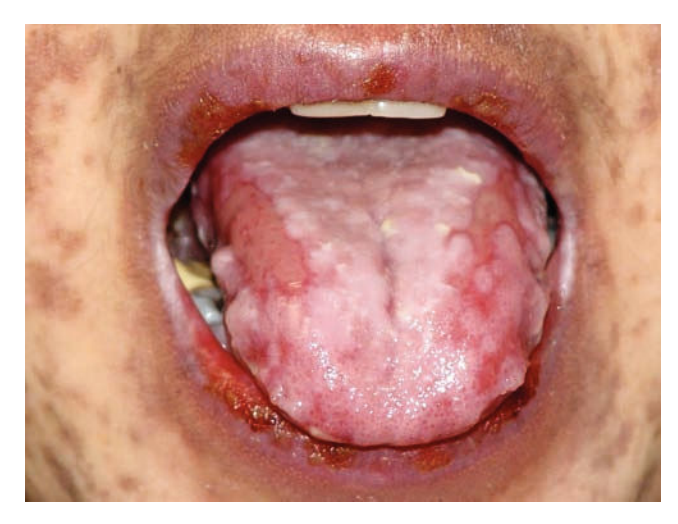
FIGURE 1: Erosions on the tongue and lips

Oral lesions are one of the most remarkable manifestations in PNP, with extensive and recalcitrant erosive mucositis. 10,32,33 They are chronic, painful erosions and crusting, and usually affect the vermilion of the lips, also covering the skin around the mouth. The lateral border of the tongue is a frequent site of involvement and erosions may occur throughout the entire buccal mucosa (Figure 1). Vesicles and blisters are seldom observed. 20 Oral lesions may be the unique expression of PNP.