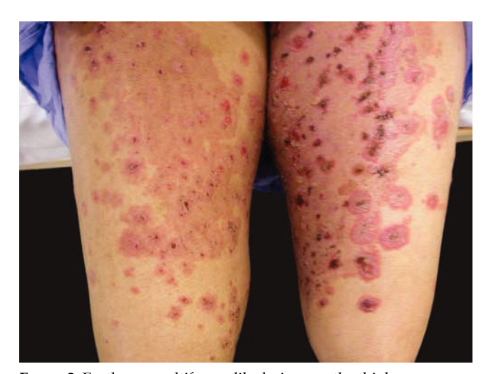
FIGURE 2: Erythema multiforme-like lesions on the thighs

Nose and genital lesions were reported, with erosions (12%) and crusting (35%) detected in PNP patients (Figure 5).<sup>32</sup> Other mucosal surfaces and organs – such as the pharynx, larynx, esophagus, and anus – are also affected. Pulmonary involvement