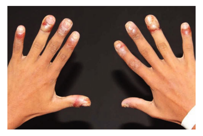
FIGURE 3: Paronychia