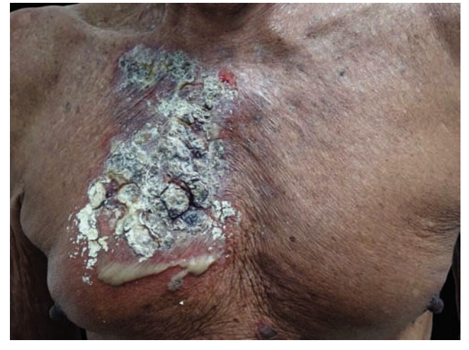
FIGURE 2: In chest, erythematous plaque, ulcerations, thick crusts, and flaccid bulla with purulent content in its lower portion