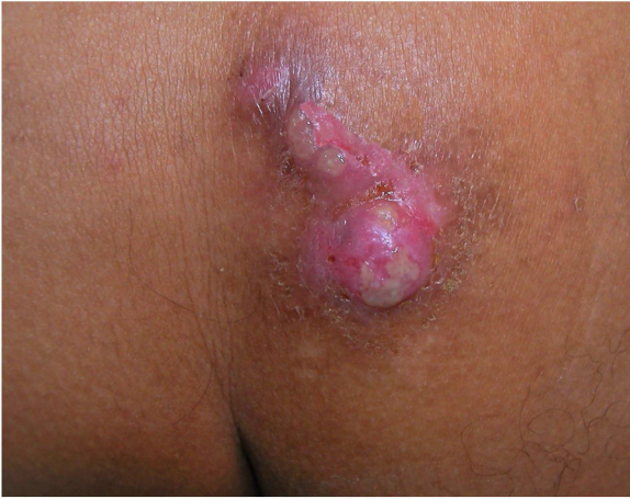
Figure 1 Multiple indurated, erythematous nodules with superficial erosions with irregular, geographic borders.