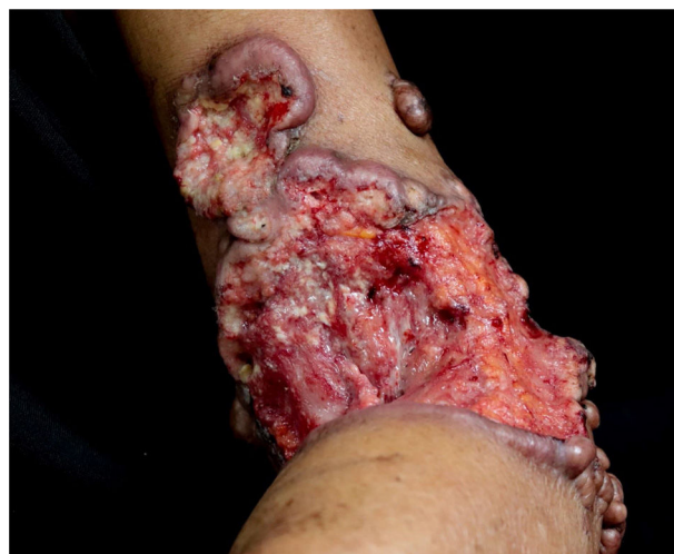
Figure 2 Ulcerated tumor, with exposed tendon, bleeding, raised edges, and presence of keloid-like nodules.

Histopathology of the left upper limb tumor showed a dense lymphocytic inflammatory infiltrate, presence of horn pearls and proliferation of squamous cells with moderate pleomorphism, hypertrophic and hyperchromatic nuclei,