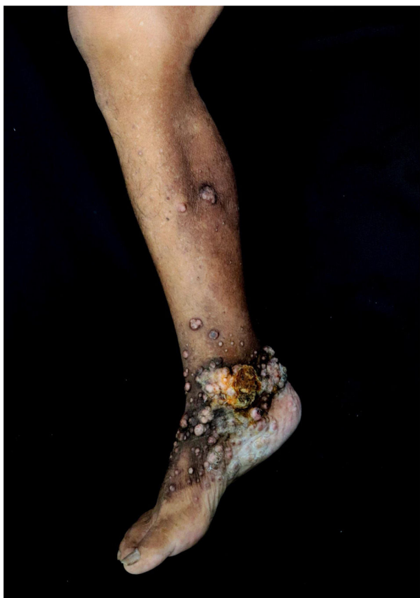
Figure 1 Keloid-like papules and nodules on the right lower limb.

structures more clearly (Fig. 3A). Direct mycological examination showed elliptical, thick-walled fungal elements in a chain-like arrangement, isolated or presenting single budding.