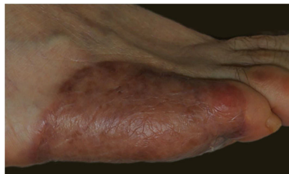
Figure 5 Six-month follow-up shows excellent engraftment without skin retraction or ulceration.

Secondary intention healing causes a prolonged disability and may lead to tissue necrosis, scar contraction, or contour abnormalities. Full-thickness skin grafts provide adequate coverage, although an exceptionally large donor site is required in defects larger than 5 cm that may not always be available. The authors' experience with skin grafts in this