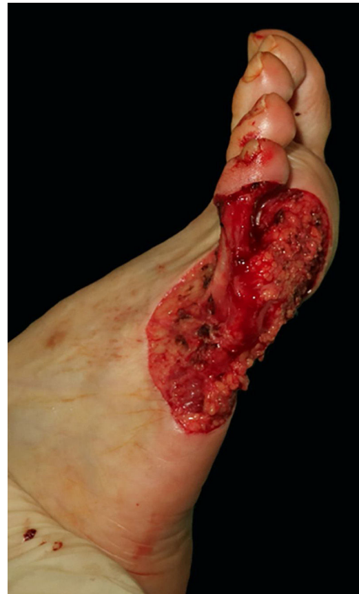
Figure 2 Surgical defect lateral and plantar surface of the right foot measuring 8,5 × 10 cm and involving the fourth interdigital space.

After a discussion of repair alternatives with patient, the application of this dermal skin substitute was elected. The matrix was cut to fit the size of the defect in two pieces: one for the lateral and plantar surface, and a small piece for the coverage of the fifth phalanx. The collagenous inner layer of both pieces was placed in contact with the wound bed and secured with a 3/0 Nylon suture (Fig. 3). The authors prefer to use sutures rather than surgical staples in weight-bearing areas, as the latter may cause occasional pain if pressure is applied unconsciously. A few vertical incisions were performed on the protective silicone layer to facilitate the drainage of post-operative exudation or hematoma. The surgical area was covered with a non-adherent silicone dressing, gauze and low compression bandage up to the knee. The patient was instructed to avoid local pressure in the following weeks. Follow-up visits were performed every week, dressings were replaced in each visit, and the matrix was constantly examined for signs of infection, air bubbles or hematoma. The early identification of the latter in the first postoperative days is critical for adequate engraftment, and they can be easily drained with a sterile needle puncture.