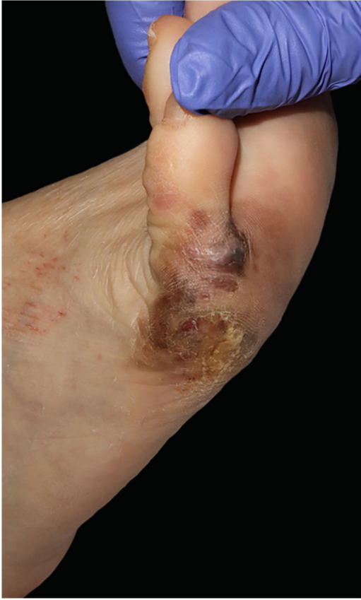
Figure 1 Acral lentiginous melanoma on the plantar and lateral surface of the right foot.