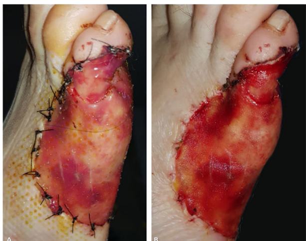
Figure 4 Three weeks after matrix placement. (A), The matrix reveals an orange tone through the outer silicone layer. (B), The outer silicone layer is easily removed and the "neo-dermis" is temporarily exposed and covered by a split-thickness graft.

Secondary intention healing causes a prolonged disability and may lead to tissue necrosis, scar contraction, or contour abnormalities. Full-thickness skin grafts provide adequate coverage, although an exceptionally large donor site is required in defects larger than 5 cm that may not always be available. The authors' experience with skin grafts in this