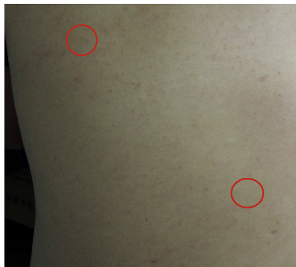
Figure 1 Clinical features at presentation. Two coin-sized subcutaneous nodules on the back (red circle), and the skin overlying the nodules was normal.

the nodules was normal. There was no lymphadenopathy or hepatosplenomegaly. The supposed clinical diagnosis of the