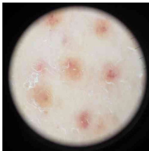
Figure 2 Dermatoscopy of the lesions showed red-brown spots and globules arranged on a background of coppery-red pigmentation.

Skin biopsy showed a thinned epidermis, lichenoid infiltrate in bands with lymphocytes in the papillary and reticular dermis (Fig. 3A), small non-necrotizing granulomas in the dermis formed by deposits of epithelioid cells and multinucleated giant cells, surrounded by lymphoplasmacytic cells, without necrosis (Fig. 3B). Erythrocyte extravasation and a few eosinophils were observed, with the absence of vasculitis. Hemosiderin deposits were demonstrated using Prussian blue iron stain (Fig. 3C). Periodic acid–Schiff (PAS) and Ziehl–Neelsen staining were negative.