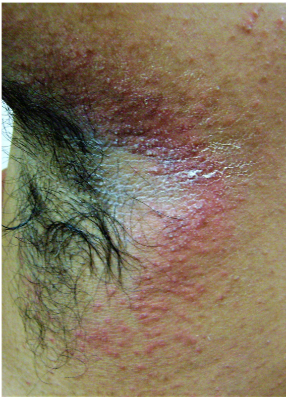
Figure 1 Clinical image of tinea incognito lesion over the right axilla of a young male – minimally raised erythematous plaque with ill-defined borders, shiny surface with peripherally scattered, mildly scaly papules. Onset four months previously; history of intermittent application of steroid-antifungal cream and oral itraconazole intake.

Topical corticosteroid abuse not only renders therapeutic management challenging, it is contributing to the growing epidemic of antifungal therapeutic failure. 1,2 The utility of dermoscopy in rapid diagnosis of tinea capitis is well-established. 3 However, dermoscopic diagnosis of tinea corporis, especially the incognito variant, has been sparingly reported. 4