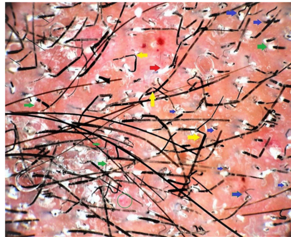
Figure 2 Polarized dermoscopic image of the lesion revealed patchy erythema, perifollicular scales (green arrow), and casts (red arrow), black dots, broken hairs, and comma and cork-screw hairs (blue arrows). The entire field is filled with translucent and deformable hairs with bends (yellow arrows), and Morse-code hairs showing horizontal skip white bands. Additionally, dotted vessels (green circle) and scattered telangiectasias (green arrows) were seen. The larger red blotches represent excoriation-induced, dried up blood-crusts (Dermlite 4, x20).

Altered morphology, logistic issues associated with in-house light-based microscopy, and time delay of fungal