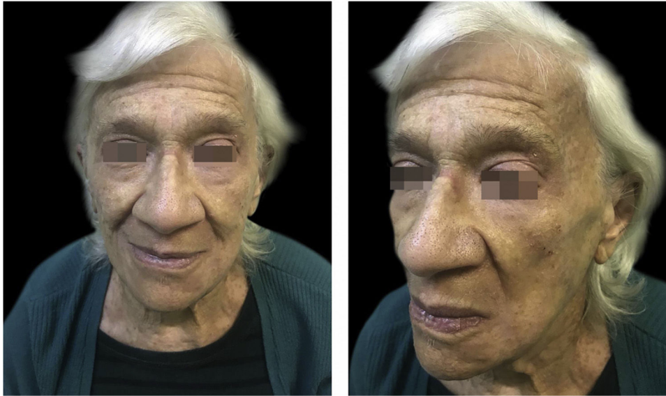
Figure 3 Regression of numerous lesions after 7 weeks of therapy with acitretin.

fluorouracil, corticosteroids, imiquimod, and tretinoin, also demonstrated little benefit. 4