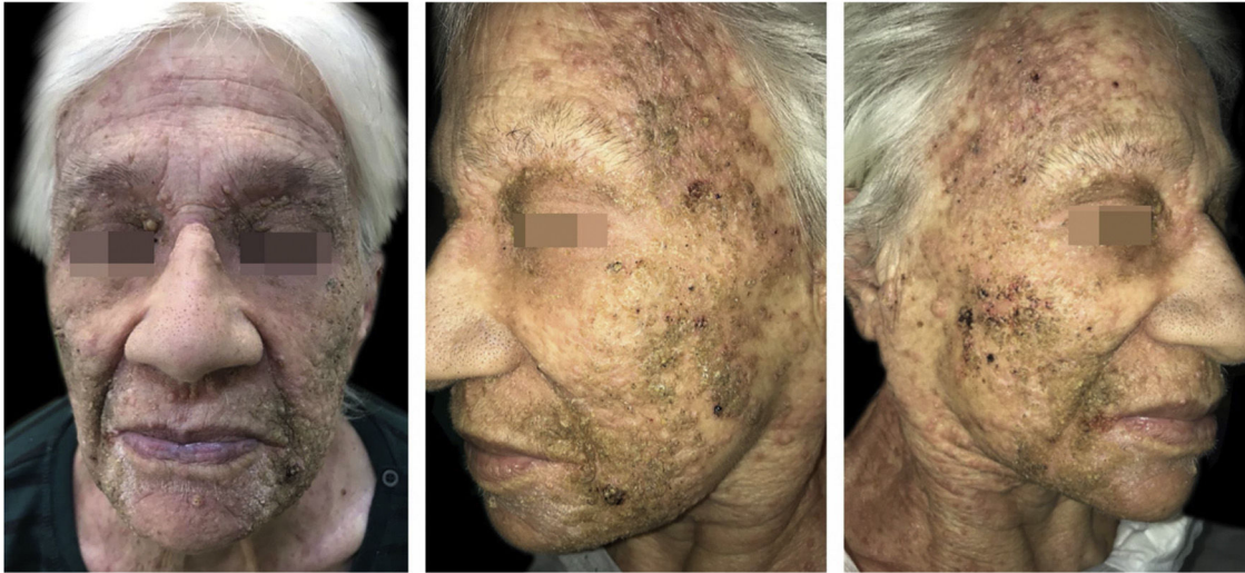
Figure 1 Multiple skin-colored to erythematous to brownish, 1–2 mm papules, with a slightly keratotic center, sometimes coalescing into verrucous plaques; koebnerization is also present.