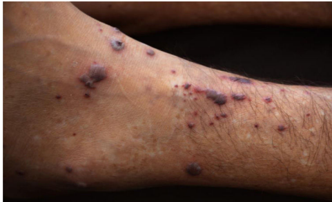
Figure 2 Palpable purpura and necrotic vesicles on the left lower limb.

inflammatory process with central caseation. The bronchoalveolar lavage revealed three alcohol-acid fast bacilli (AAFB).