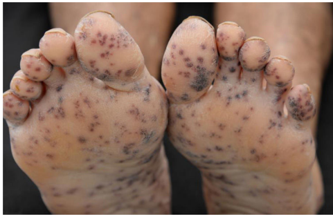
Figure 1 Multiple, bilateral palpable petechiae and purpura on the soles.