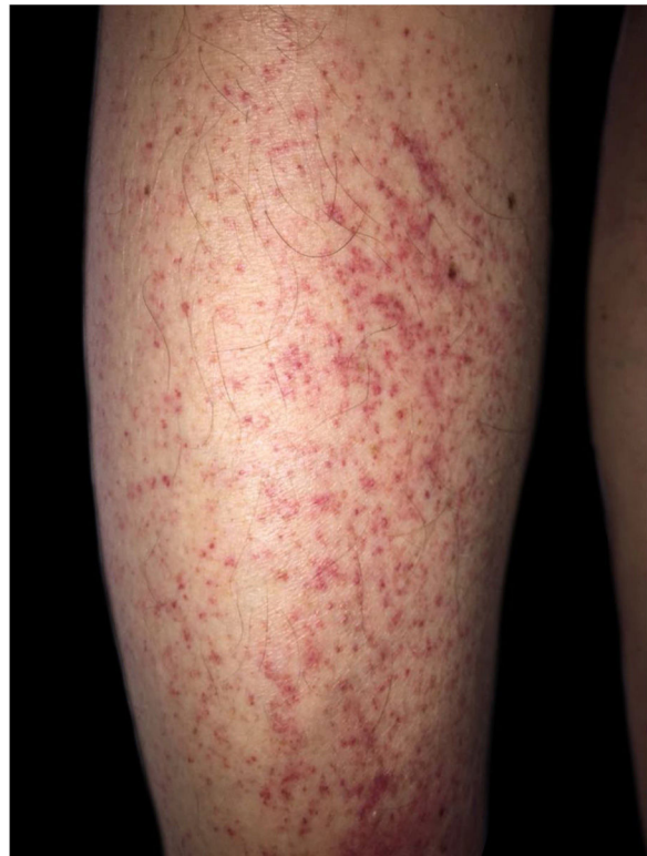
Figure 2 Perifollicular purpura.