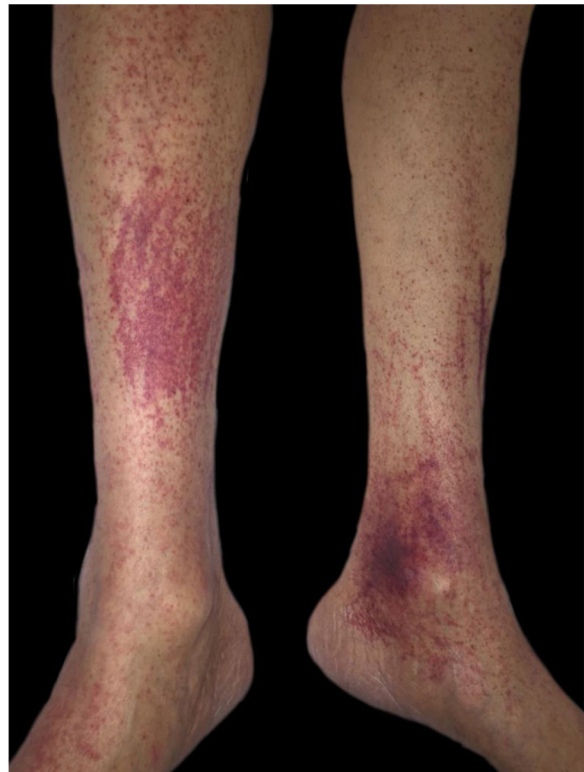
Figure 1 Purpuric areas in the lower limbs.

Scurvy is caused by ascorbic acid (vitamin C) deficiency; vitamin C is found in fresh fruits and vegetables. 2,3 Throughout history, scurvy was mostly diagnosed during the great Irish potato famine between 1845 and 1849, when the population of that country was reduced by 20% to 25%, the American civil war, and more recently the Afghanistan war in 2002. Although uncommon and remembered for its historical significance, scurvy is not a non-existent disease, especially in individuals with unusual diets, the elderly, alcoholics, patients with neoplasms or intestinal absorption disorders, and patients on hemodialysis. The kidneys reabsorb vitamin C and excrete it in the urine only when it exceeds the serum level; however, in dialysis this clearance is indiscriminate, increasing the risk of deficiency. 3