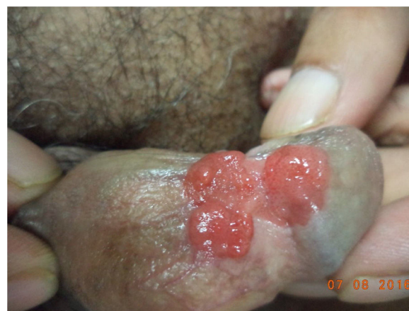
Figure 1 Well defined, erythematous, fleshy, lobulated, sessile growth involving glans, coronal sulcus and shaft of penis.

The asymptomatic beefy red lobulated plaque on the penile region has various differentials. As the patient had a negative tissue smear, the possibility of Condyloma