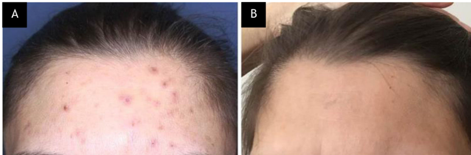
Figure 2 Case 2, (A), Erythematous and excoriated papules, and hyperpigmented macules on the forehead of the patient with acne excoriée. (B), Complete clinical improvement after 6-weeks on N-acetylcysteine treatment.

the article and revising it critically for important intellectual content; final approval of the version to be submitted.