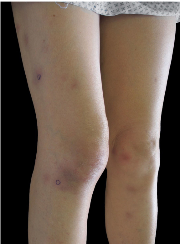
Figure 1 Erythematous subcutaneous nodules in thighs and legs.

A healthy 72-year-old woman consults for painful erythematous nodules in the extremities of two weeks' evolution, associated with fever and arthralgias. Physical examination reveals erythematous subcutaneous nodules on the extremities, arthritis, and oral ulcers (Figs. 1 and 2).