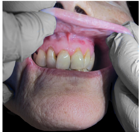
Figure 2 Oral ulcers.

Laboratory tests: hemogram of 5,850 leucocytes/L (80% neutrophils), erythrocyte sedimentation rate 70 mm/hr, C-reactive protein 158 mL/L. Glycemia, hepatic, renal and