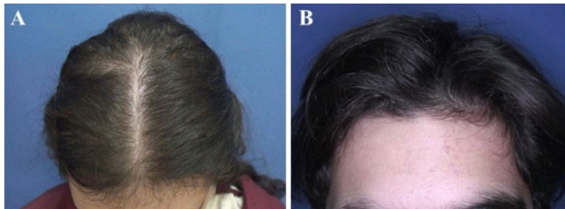
Figure 1 Hair loss patterns observed in pediatric androgenetic alopecia. (A), Diffuse thinning at the crown with preservation of the frontal hairline in a female with adolescent androgenetic alopecia. (B), Preservation of the frontal hairline in a male with adolescent androgenetic alopecia who has diffuse thinning at the crown.