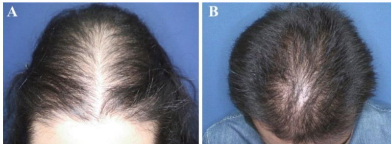
Figure 2 Hair loss patterns observed in pediatric androgenetic alopecia. (A), "Christmas tree" pattern in a female with adolescent androgenetic alopecia. (B), Bitemporal, frontoparietal and vertex thinning in a male with adolescent androgenetic alopecia.