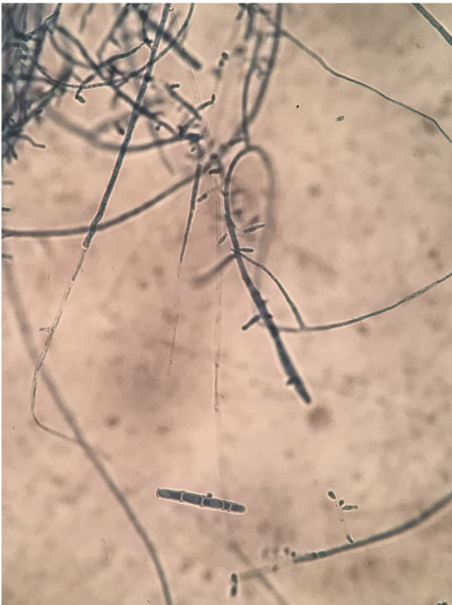
Figure 3 Microscopic examination showed clublike macroconidia and microconidia spores.

can also appear on the border of the affected area with increased inflammation. 1 Blepharitis is a chronic inflammatory disorder with complex symptoms of the eyelids and is usually caused by bacterial colonization and Demodex . 2 However, some of the reported studies suggest that it could be of fungal origin as well. 3 Noticeably, the sesame-sized milky papulopustules of our case were different from these typical features. As the symptoms were identified in the early stages, the papulopustules and periocular scaling responded well to the short-time treatments. Trichophyton can induce different clinical features mimicking other conditions, such as impetigo, eczematous dermatitis, and lupus erythematosus. 4 The site of the invasion, variable invasive capacity, individual immunity, diagnosis, and treatment procedures may associate it with various clinical manifestations and can easily lead to misdiagnosis and wrong treatment. False treatments like topical steroids could further cause an eruption of the lesions and more serious consequences. Therefore, early identification of medical history and precise diagnosis are the key aspects to prevent delayed healing or chronicity. Once identified, systemic