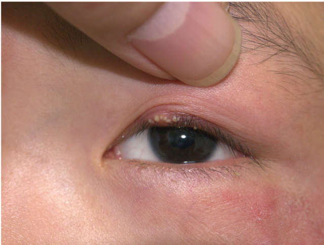
Figure 1 Clinical presentation: erythema with mildly scales on the periocular skin and sesame-sized milky papulopustules on the left upper palpebra.

A 10-year-old boy was referred to our clinic with symptoms consisting of two-week-old itchy erythema on periocular skin and multiple 3-day-old papulopustules on the left upper palpebra. The patient had animal contact about one month ago and the lesions were not treated previously. Physical examination revealed erythema with mild scales on the periocular skin and several sesame-sized milky papulopustules on his left upper palpebra (Fig. 1). Routine laboratory findings including blood and urine, hepatorenal function and immunity items were normal. Because the subject had contact with his dog, a mycological examination was performed. Multiple fungal hyphae and white fuzzy-