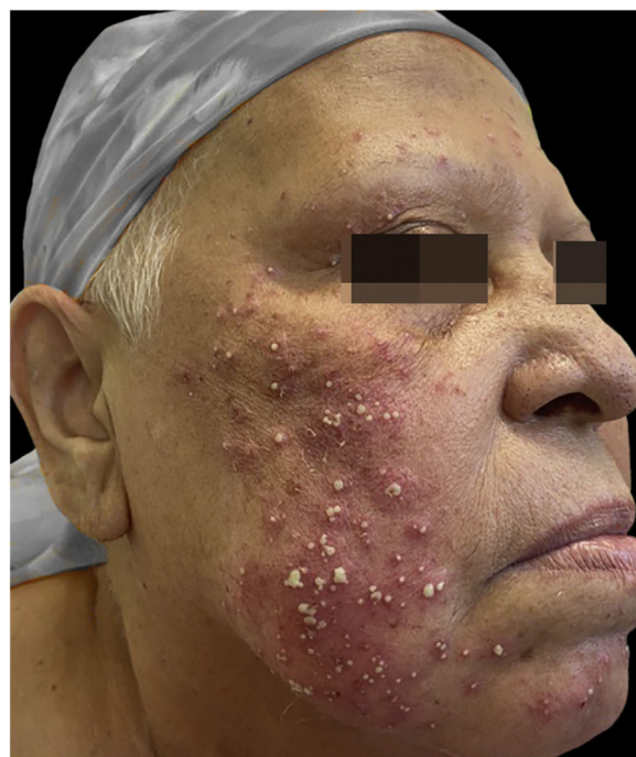
Figure 1 Presence of pustules on an erythematous base, symmetrically distributed on the face.

In conclusion, ALEP is an unusual drug-induced skin reaction, and the majority of published cases were secondary to the use of antibiotics. However, it is important to emphasize that chemotherapeutic agents of the taxane class may also be responsible for this skin reaction.