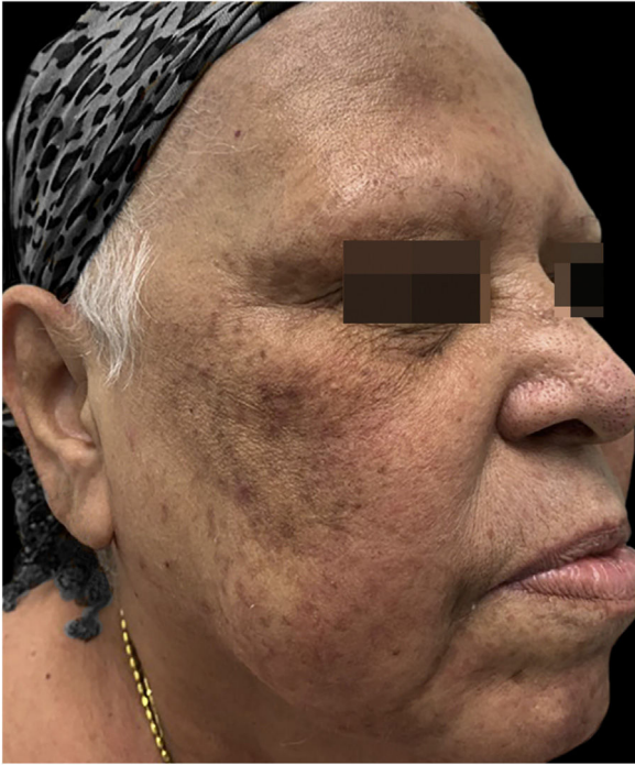
Figure 3 Post-inflammatory hyperchromia without the presence of pustular lesions.