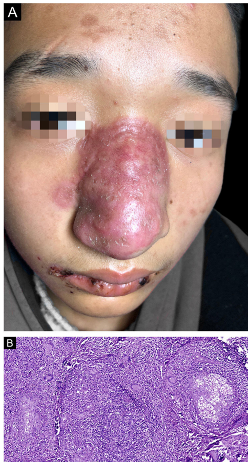
Figure 2 (A), The red plaques enlarged and involved almost the whole nasal dorsum when the patient visited again; (B), The histopathology of the second biopsy showed a similar histological profile as the first biopsy (Hematoxylin & eosin, \times 200 ).

tis. Unfortunately, the authors didn't diagnose in time and prevent the infection from rapidly worsening.