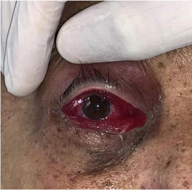
Figure 1 Erythema and severe swelling of the conjunctiva associated with upper eyelid erythema. Rhino-orbito-cerebral mucormycosis.

apy, and respiratory physical therapy. He was discharged from this hospital and immediately sought the service with edema and intense erythema on the right conjunctiva, mild erythema on the upper eyelid (Fig. 1), and ocular plegia on dynamic examination. Complementary tests showed DM decompensation, and a computed tomography showed inflammatory sinus disease. With the diagnostic hypothesis of rhino-orbito-cerebral mucormycosis, a surgical approach was performed, and the material was sent for histological examination, which showed coenocytic hyaline hyphae with a 90° angle (Fig. 2), and for fungal culture, which