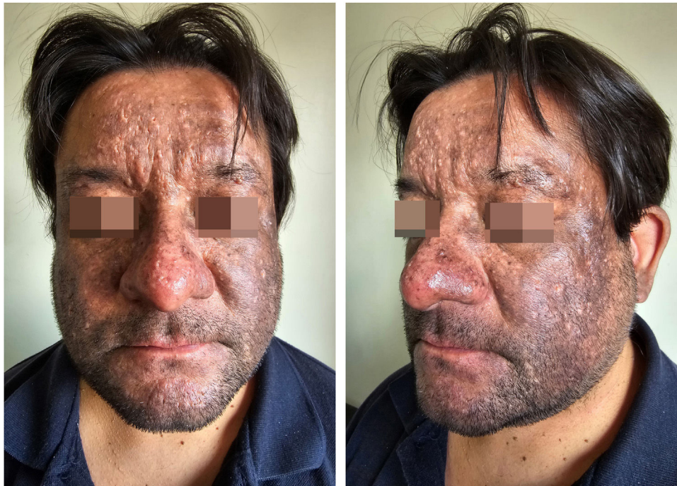
Fig. 1 Brown-gray patches with purplish hue on the face. Note eyelids involvement.

A 43-year-old male patient, undergoing golimumab treatment (100 mg monthly) for a year due to a history of ulcerative colitis, presented with a progressive facial hyperpigmentation evolving over six months. The patient, with Fitzpatrick skin phototype IV, worked a desk job and had minimal sun exposure. He denied any prior history of facial or mucosal hyperpigmentation and confirmed no prior usage of topical treatments or daily cosmetic products. On physical examination, diffuse pruritic, brown-colored hyperpigmen-